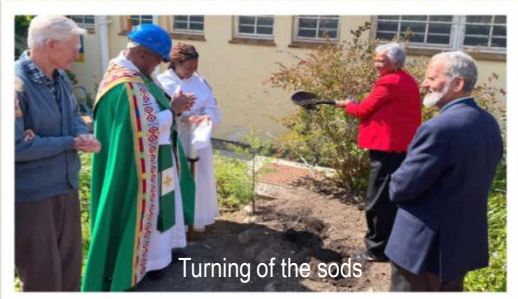
Turning of the sods