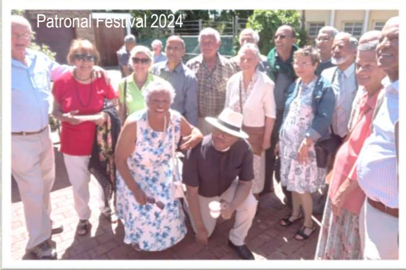
Patronal Festival 2024