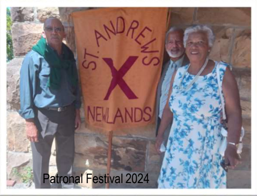
Patronal Festival 2024