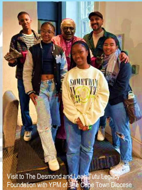
Visit to The Desmond and Leah Tutu Legacy Foundation with YPM of The Cape Town Diocese