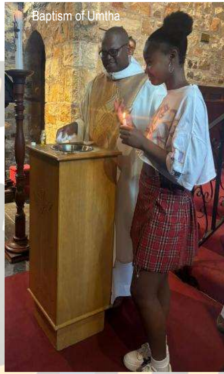
Baptism of Umtha