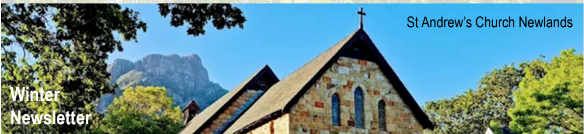
St Andrew's Church Newlands