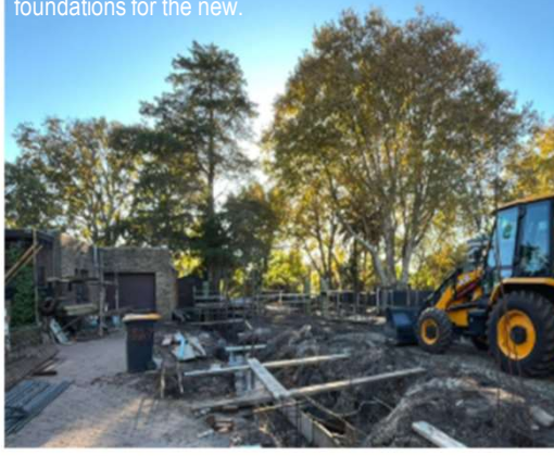
An autumnal dawn as we say goodbye to the old and lay the foundations for the new.