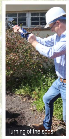
Turning of the sods