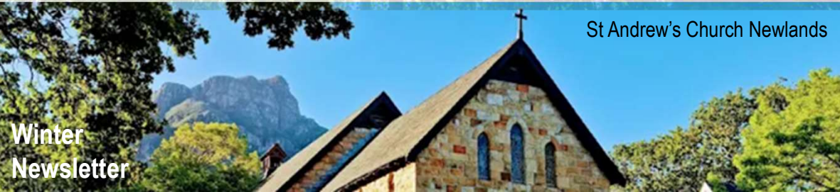
St Andrew's Church Newlands