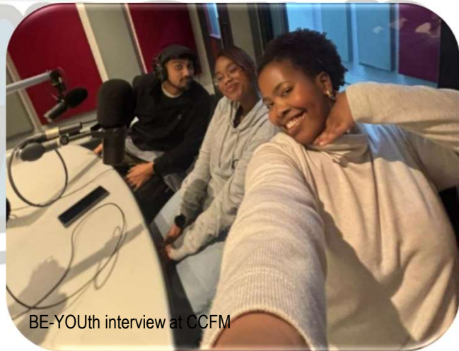
BE-YOUth interview at CCFM