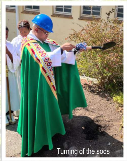
Turning of the sods