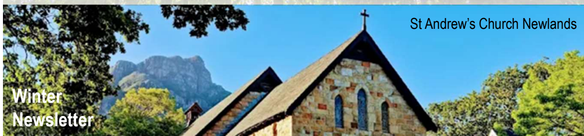
St Andrew's Church Newlands