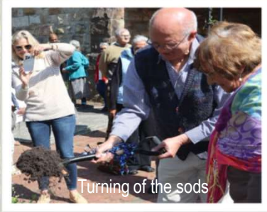
Turning of the sods